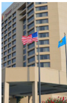
TOWER HOTEL Oklahoma City, OK